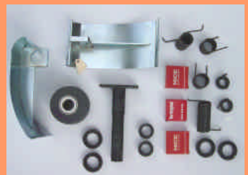
Some Components of Kit 1312-30935