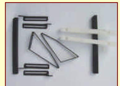
Some Components of Kit 3311-30962

The Quipp Model 35X stackers will require a modification.