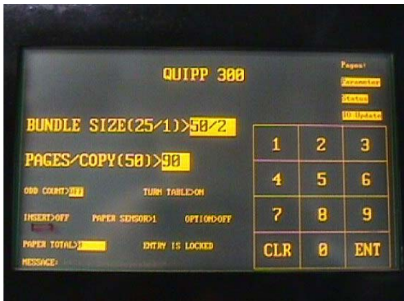
Original 300 Stacker Screen

The 300 ENHANCED ELECTRONIC CONTROL KIT can be installed by experienced Quipp field service personnel.