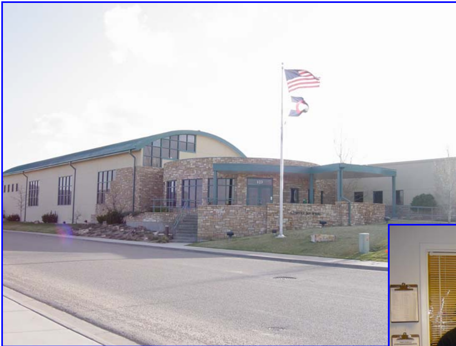
Cortez Journal Cortez, CO

Quipp sells an inserter to Montezuma Valley Publishing in Cortez, CO, a NEWSCOM 6 Inserter Software Upgrade to Mail-Tribune in Medford, OR, a Quipp Packman to the News-Journal , a Quipp Packman to the Post & Courier and five (5) Quipp Vipers to The Edmonton Journal