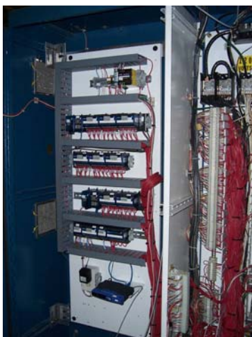
I/O Side of Cabinet