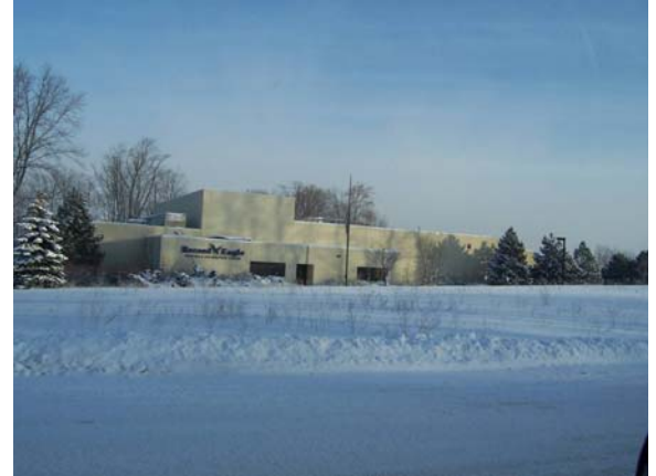
The Record-Eagle, Traverse City, MI