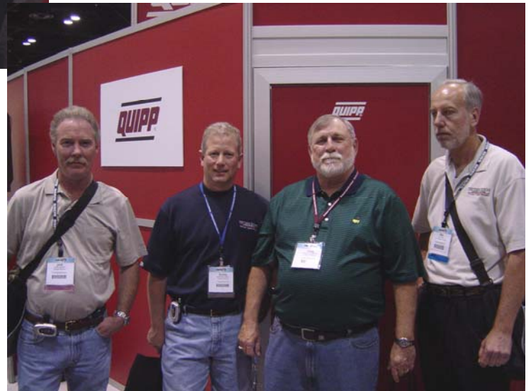
The Tampa Tribune team visited the Quipp Booth in Orlando in April 2007!

The Tampa Tribune, a Media General newspaper, has been a Quipp customer for many years and over these years has purchased four (4) Quipp Model 351 Stackers, eight (8) Quipp Model 401 Stackers, ten (10) Quipp Model 501 Stackers, seven (7) Quipp Vipers, two (2) Quipp Packman Systems and a variety of floor conveyors.