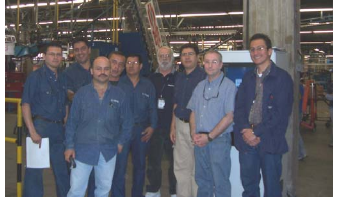
El Tiempo staff being trained on their new Quipp NEWSCOM 6 Inserter Control