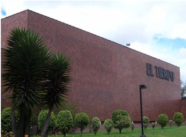
El Tiempo, Bogotá, Colombia