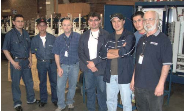
El Tiempo staff being trained on their new Quipp NEWSCOM 6 Inserter Control