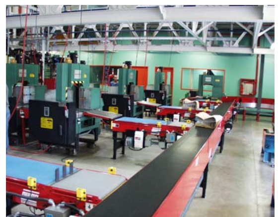
Quipp BDS Bundle Distribution System installed in 2000