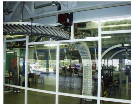
Quipp-Gripp II Single Gripper Conveyor System installed in 2000