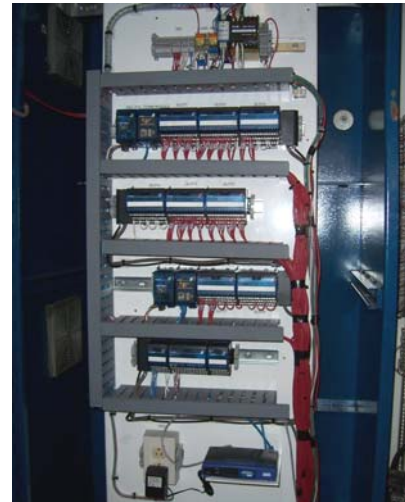
Quipp NEWSCOM 6 Inserter Control System (new I/O panel shown above)