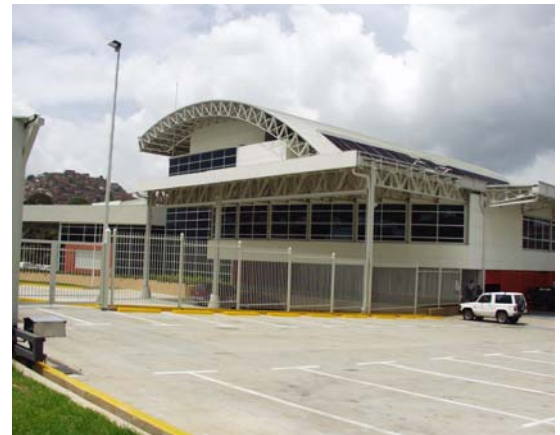
C.A. Últimas Noticias Caracas, Venezuela

The entire mailroom system is due to be operational in the fourth quarter.