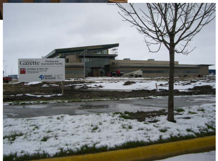
The Janesville Gazette/ Bliss Communications Janesville, WI