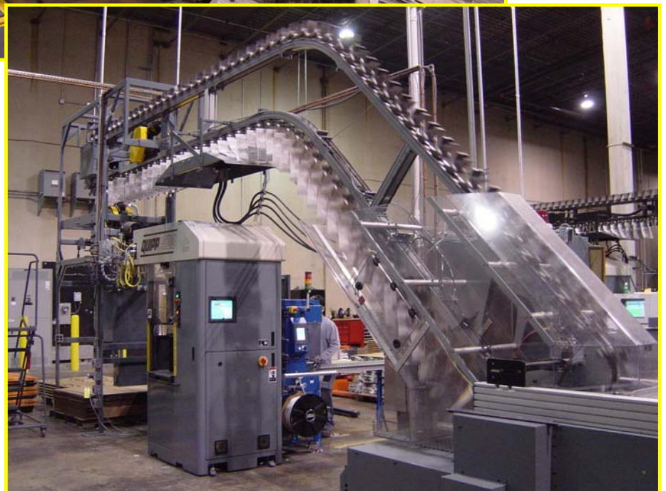
Pictures of the Quipp Equipment installed at the American Color Graphics Plant in Dayton, NJ.