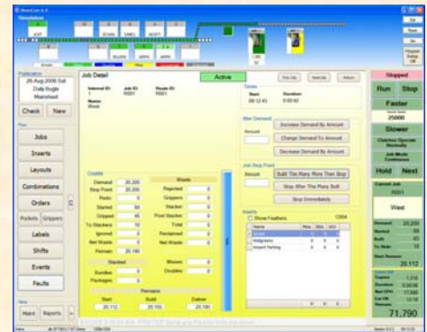
NEWSCOM 6 SCREEN SHOT

Looking for greater accuracy in targeting your inserts to specific audiences as well as enhanced accountability and reporting capability? The NEWSCOM 6 will benefit your inserting operations.