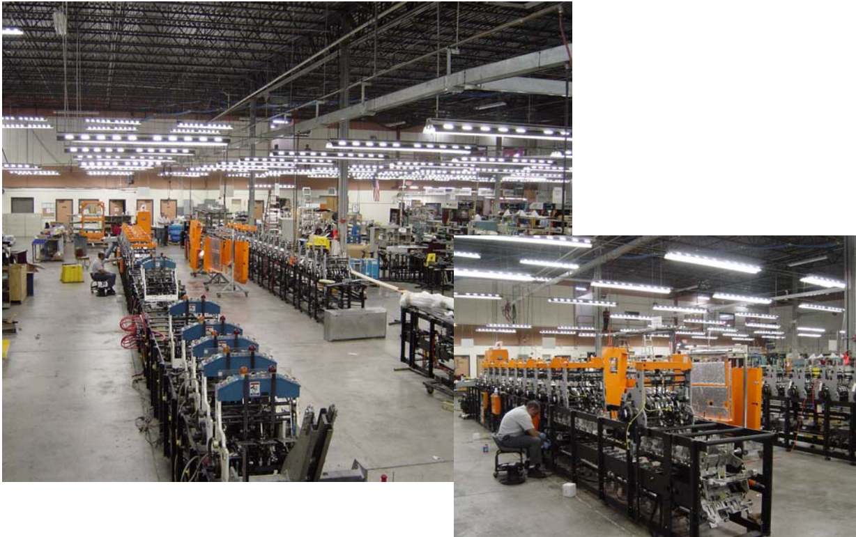
Quipp-Newstec High-Speed Inserters Being Built in Miami.