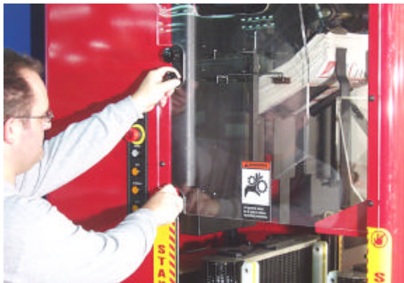
Quipp Adjustable Side Guide Kits

To request a quote and/or additional information about these kits, please contact our Parts Department at 1-800-258-1390 or at parts@quipp.com