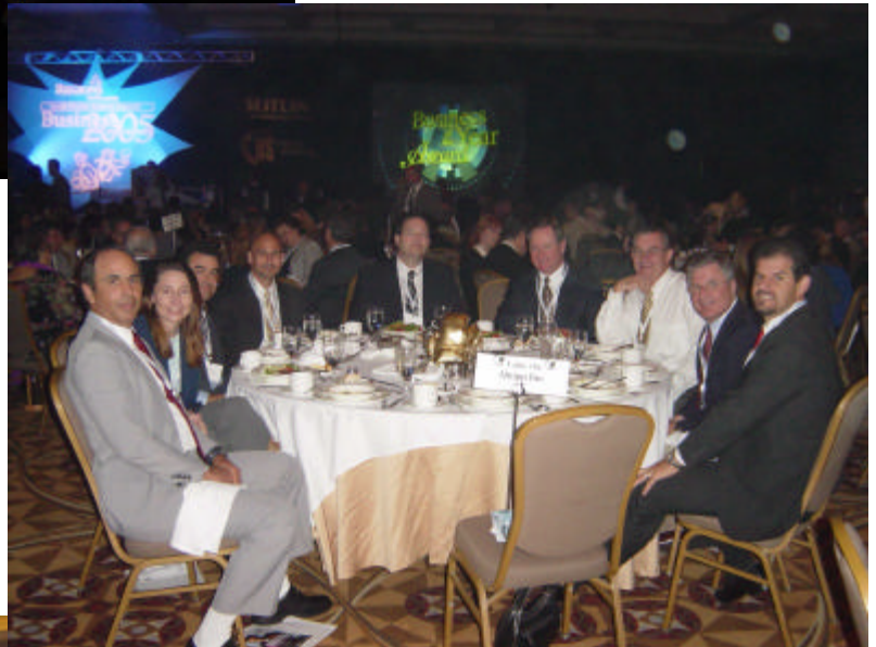
Above: The "Proud" Quipp Table