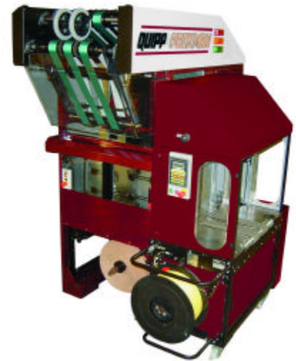
Quipp PACKMAN Packaging System: STACK, WRAP, PRINT & STRAP IN ONE FAST, RELIABLE OPERATION

The equipment will be installed in their facility in Baton Rouge, LA in 2006.