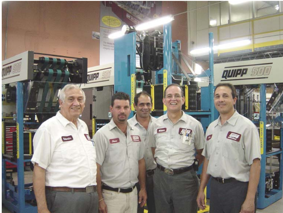
Quipp Stacker Assembly Department