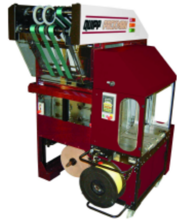
Quipp PACKMAN Packaging System

The installation of the equipment to be supplied by Quipp will begin in the first quarter of 2006.