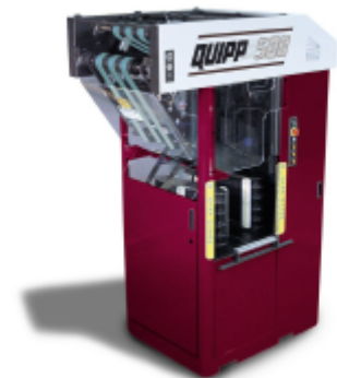
Quipp Model 500C Stacker with Bundle Compression Capability & Stream Squeeze Roller